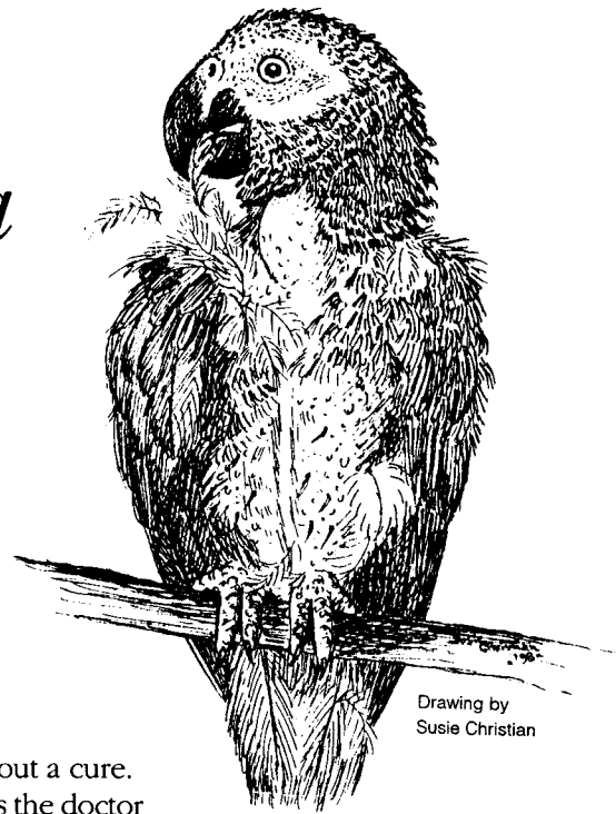
Drawing by Susie Christian

According to Dr. McCluggage, birds have a high metabolic rate. Many birds have a heart rate of 200 plus, and a high body temperature that often is greater than 103°F. Birds are light and relative-