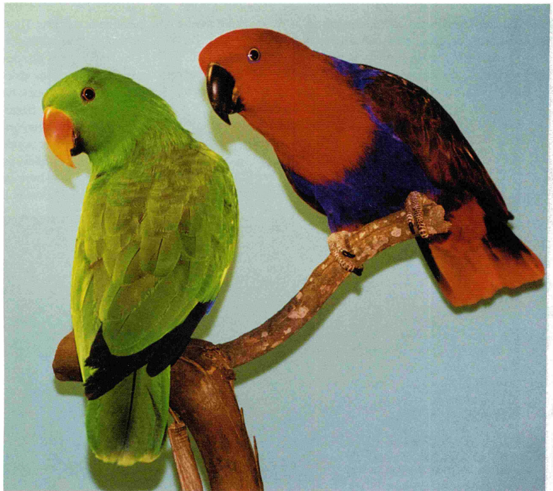
A beautiful pair of Biaki Eclectus.