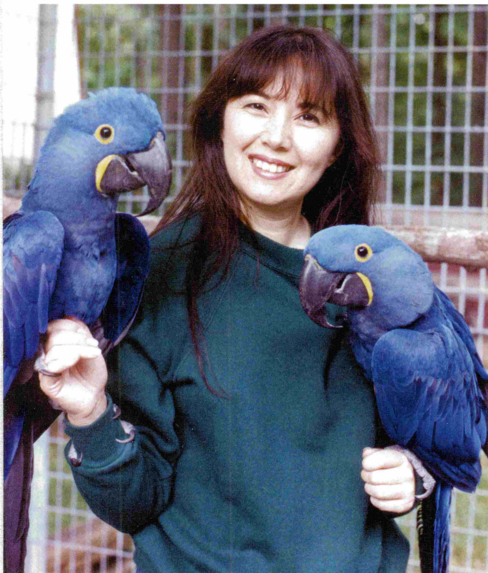
Proper weaning and fledging is an important part of raising healthy, well adjusted companion birds. The author and two well adjusted companion birds she raised.

yet are able to sustain themselves on their own. When a chick is unable to break away from this psychological need it is due to fear and a need for attention. It is possible to sooth this fear by offering the baby solid foods by hand and giving the baby more attention. However, if babies are well past the age of independence and still appear to have a need for hand-feeding they should be examined by an avian veterinarian; these chicks often have a mild infection that prevents them from becoming completely food independent. Baby birds are fully weaned when they are no longer begging for hand feeding formula and they are maintaining a healthy weight for their age and species.