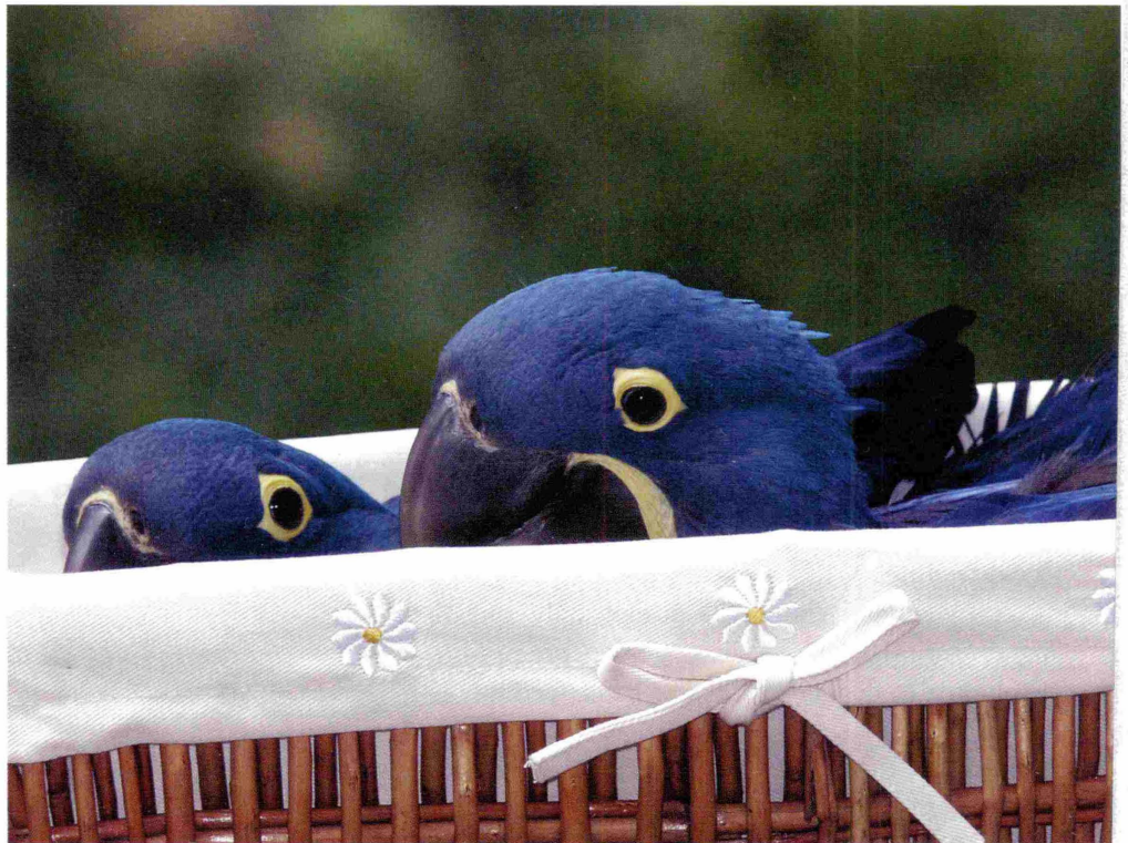
These shy Hyacinth chicks are just old enough to begin getting curious about the world around them.

Once babies are nearly feathered, drop them a short distance onto a soft surface like a bed or a pillow. This teaches them to start thinking about what muscle to use to land and begins to alleviate the fear of falling. Most hand-raised babies will begin to fly by taking big hops, encourage them to hop