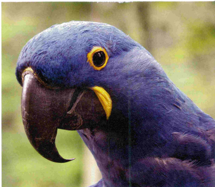
"Sapphire" — For a bird to be beautiful and healthy, it must eat well.

Eventually they will accept only one hand feeding a day. At this stage they are psychologically dependent on the hand feeding,