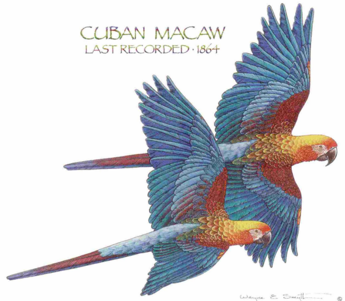
CUBAN MACAW LAST RECORDED · 1864