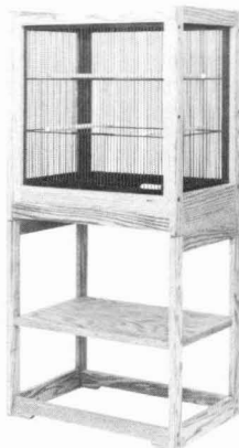
MODEL #101-shown on stand OAK - $425.00 WALNUT - $478.50

SOME OF OUR OTHER FINE PRODUCTS . . . Avia, Super Hygliceron B, Vionate, Trace Minerals, Wheat Germ Oil, Vita-C, OR-LAC.