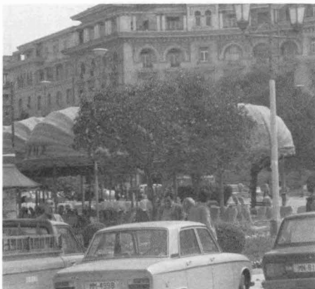
Central square downtown Thessaloniki, Greece, the location of the World Conference on Birds of Prey.

During 26-29 April 1982 raptor researchers and conservationists from around the globe gathered in Thessaloniki, Greece for a conference jointly organized by the I.C.B.P. World Working Group on Birds of Prey and the Government of Greece. Although the conference theme was a workshop on the conservation and management of birds of prey in the Mediterranean, numerous workshops were held that pertained to other regions. A sample of the workshop topics include conservation and education on birds of prey, methods for studying conservation problems of birds of prey during migration, conservation and management of vultures and conservation strategy for birds of prey in tropical forest.