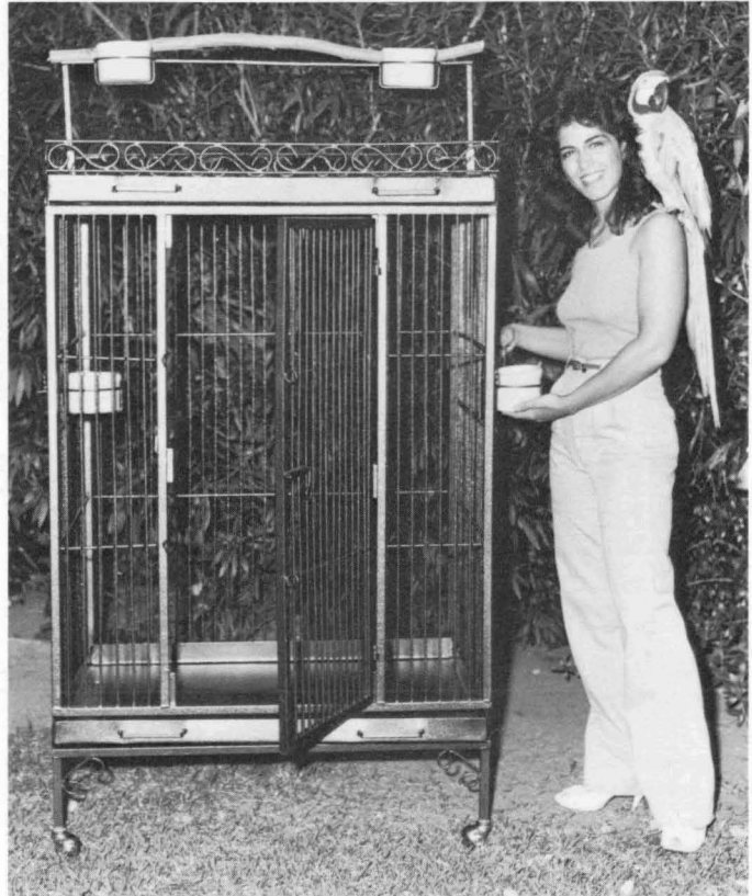
"THE MAJESTIC MACAW" 58" TALL X 36" WIDE 24," 30" or 32" DEPTH