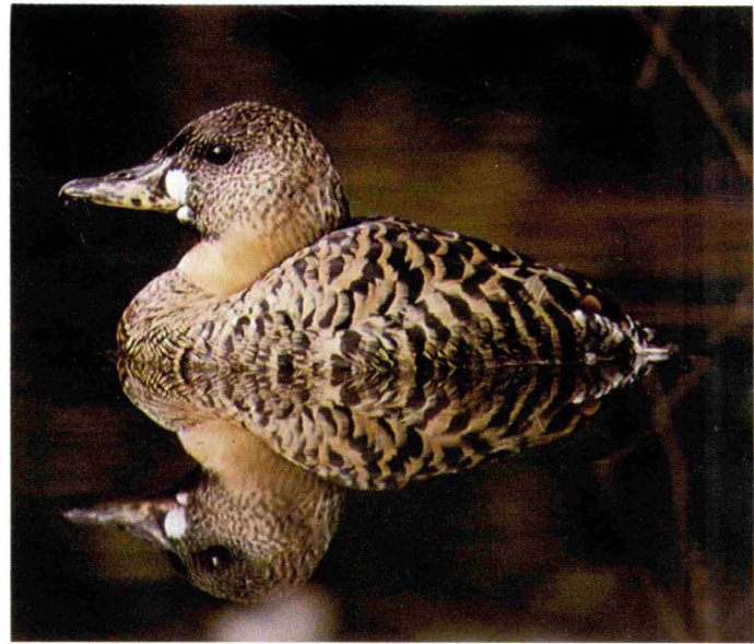
African White-backed Duck (male)