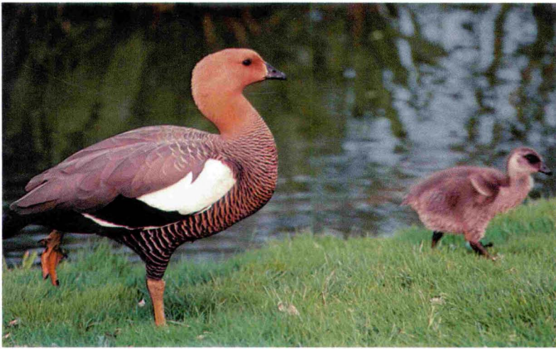
Greater Magellan Goose (female) with gosling