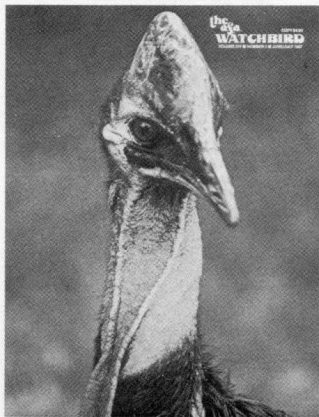
FRONT COVER — Cassowary by Tim Schexnaydre, Convent, Louisiana, a 3rd place winner, color print category, 1985 Watchbird photo contest.

Our apologies to the photographers of the beautiful front and back covers of the June/July '87 issue of Watchbird . The descriptive text ran a bit long and the very important photo credits were accidentally omitted.