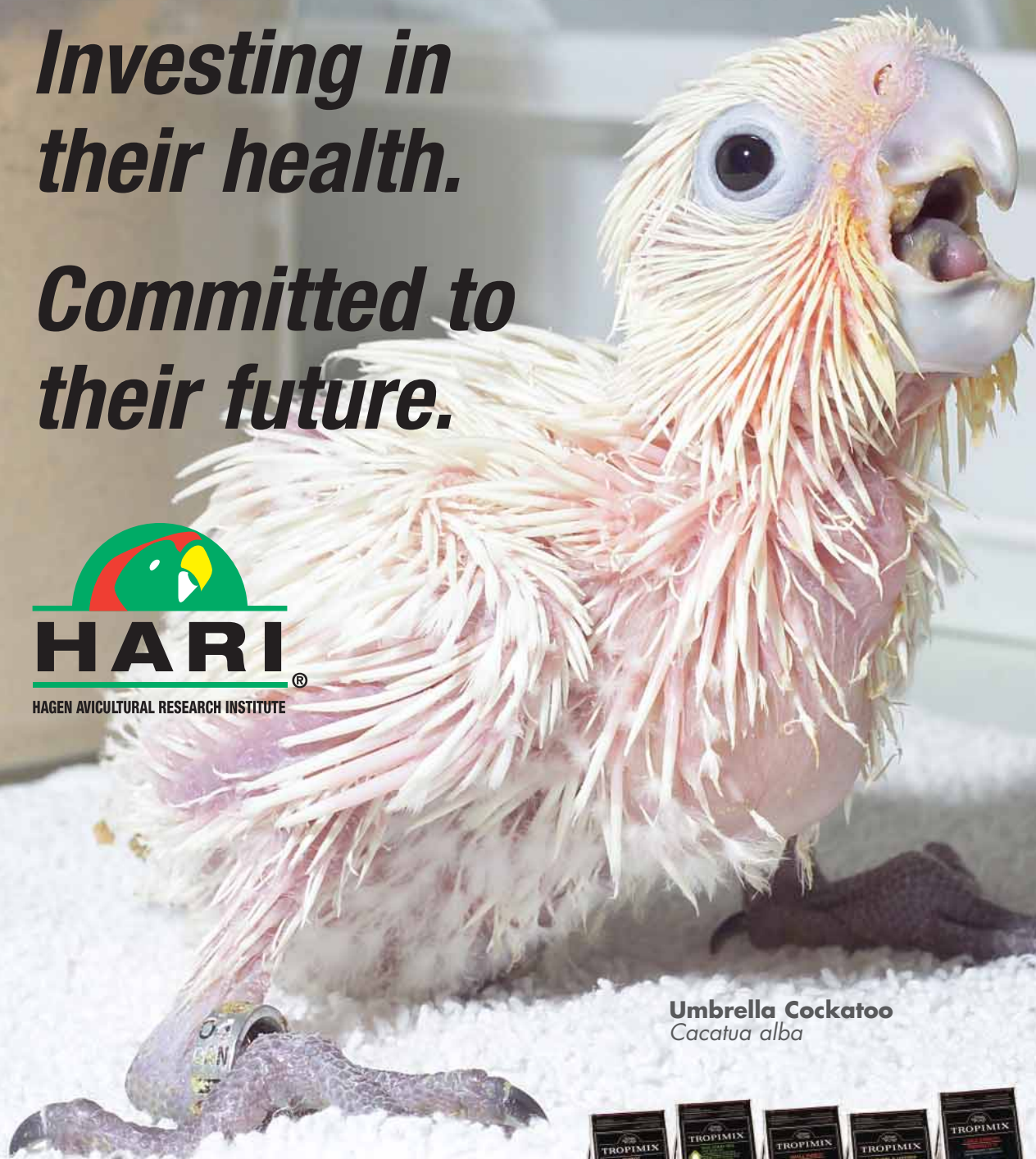
Umbrella Cockatoo Cacatua alba