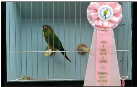
A rare Hoffman's Conure.