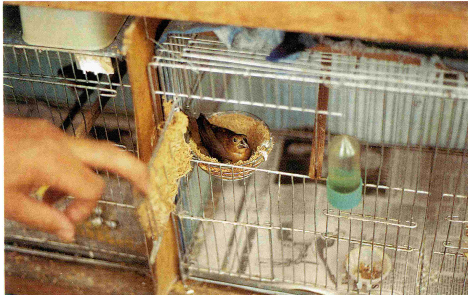
A Bicudo hen on eggs.