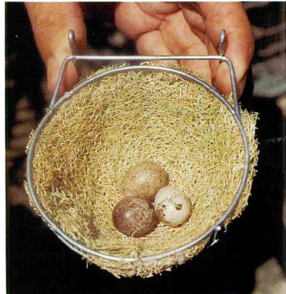
Bicudo eggs in a nest. The eggs are often fostered under other females. The eggs can be held 7 days before they must be incubated.