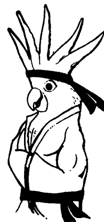
KUNG FU YUM®

They'll respond to the security of CRAZY CORN® , their reliable source of thrilling soft foods! Lowfat, all natural broad nutrition. NO ADDITIVES. Exciting (unlike pellets) — relished by ALL SIZE birds! Useful to self-wean chicks!