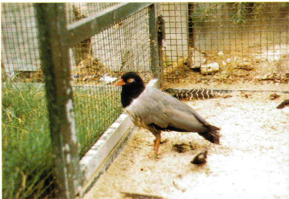
Renauld's Ground-cuckoo, an uncommon but very interesting Southeast Asian bird in aviculture.

The Renault's Ground-cuckoo is not common in aviculture and is not kept by the average aviculturist. Only if one has a very large aviary and is looking for a challenge, does one acquire this challenging bird.