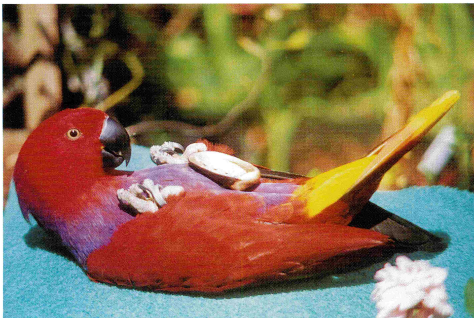
Eclectus make wonderful pets and can become very trusting and playful.

struck, dazzled, weak in the knees, and filled with admiration. I am truly blessed to have Eclectus Parrots and privileged to be trusted to care for these awesome creatures. ➤