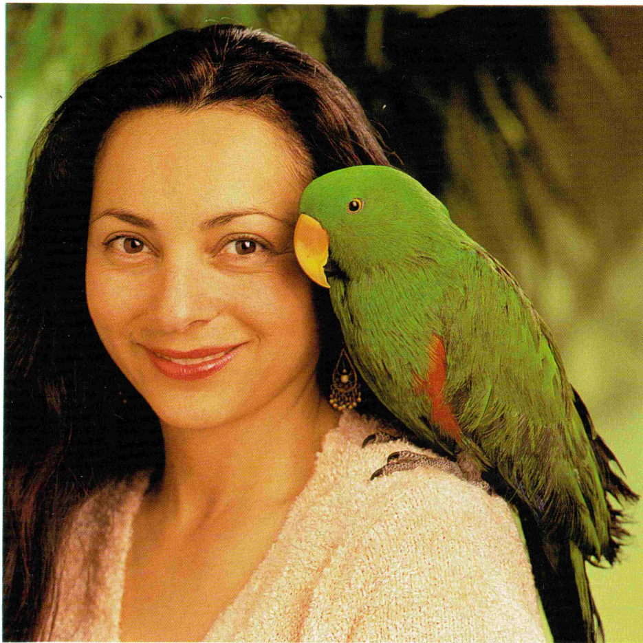
Beamer, a male Red-sided Eclectus is a remarkable companion and entertainer. He has full run of his owner's house and goes everywhere with her in the car.

in after him. All I could see was my green-feathered friend floating down river with his head high above the water. Luckily, my friend was faster than the flow of the river and successfully rescued him. I couldn't believe what I'd just witnessed. Due to his floating with his head and wings above the water, only the feathers on his underside were wet. It could have been disastrous had Beamer not gone with the flow. Ha ha!!