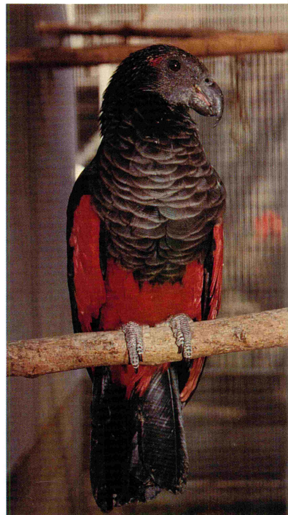
The odd-looking Pesquet's Parrot is uncommon in aviculture.

Breeding many rare and endangered species, BII has had exceptional success with the production of the Spix's Macaw. To date they have raised 22 baby Spix's (to the third generation) and are holding a total of 24 which is 68% of the world's population of this species. BII is cooperating with the government of Brazil in the "Spix's Macaw Recovery Project." Indeed, the lone wild bird (a male) was given a female companion in 1995 and the two were seen flying together for a while—the only pair of Spix's not in captivity. A female Spix's Macaw from BII replaced the bird that was released. Unfortunately, a recent report suggests that the two Spix's in the wild are no