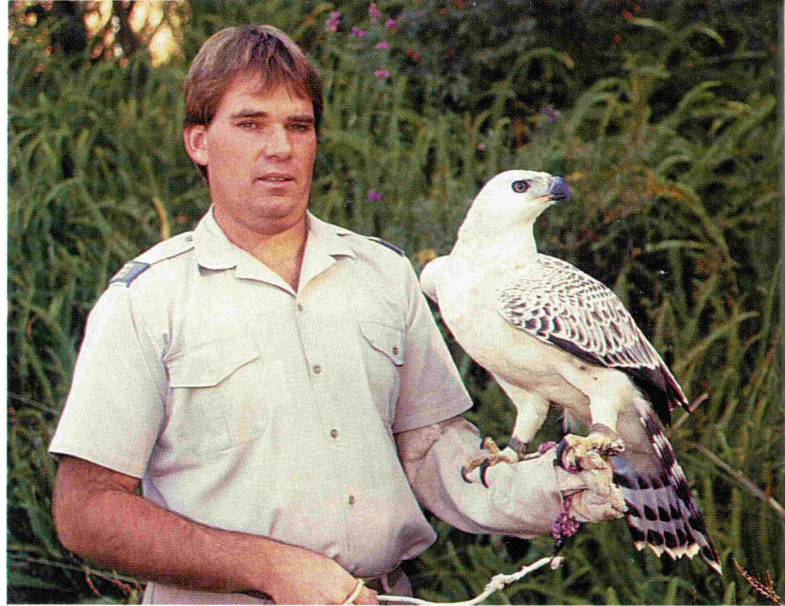
The author with a large Crowned Eagle on his arm. This kind of hands-on live-bird demonstration gets a lot of attention when teaching young folks about conservation.

Melmoth and Babanango areas to start reporting raptor nest sites. From this work I had received reports of 14 active Crowned Eagle nests. Unfortunately, the drought had an impact and nesting attempts were limited to a few pairs. Fortunately, however, we found two nests which were active and managed to remove a second chick from one nest containing two newly hatched chicks, and an egg from a nest which already had a chick. While monitoring the nests it was necessary to climb to the nests periodically and during this procedure the adults remained in the vicinity calling. At no time did they attempt to attack the intruder. It was interesting to note that on returning to check on the progress of the two chicks which remained in the wild, firstly both fledged successfully and secondly both were the same sex as their siblings which I had raised.