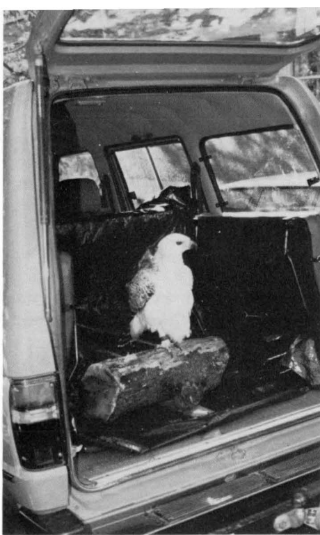
While traveling from place to place to give slide shows on the eagle and conservation, the Crowned Eagle rode in the truck.

feeds were reduced to three a day and dark quills appeared over the back, wings and tail. The chick was spending increasing amounts of its time standing, but while sleeping it stretched out flat