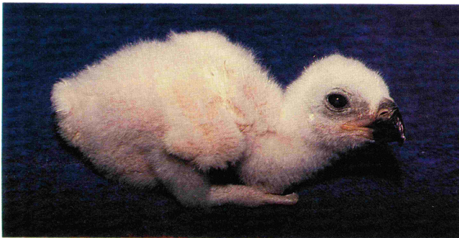
This and other Crowned Eagles were raised from the egg or taken as tiny chicks from the nest.

By a month old (830 g) the bird was standing strongly and flapping its "wings"—the first quills had begun to show on these. At six weeks (1562 g)