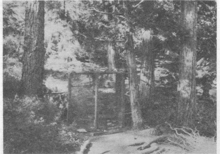
Budgies enjoy a large flight aviary among the tall tree at Awhanee Boy Scout Camp near Big Bear. They'll return to school this fall.

At the close of the school session, the cages and birds were taken to the Awhanee Boy Scout Camp near Big Bear. The birds were placed in a large aviary in the nature study area for the summer.