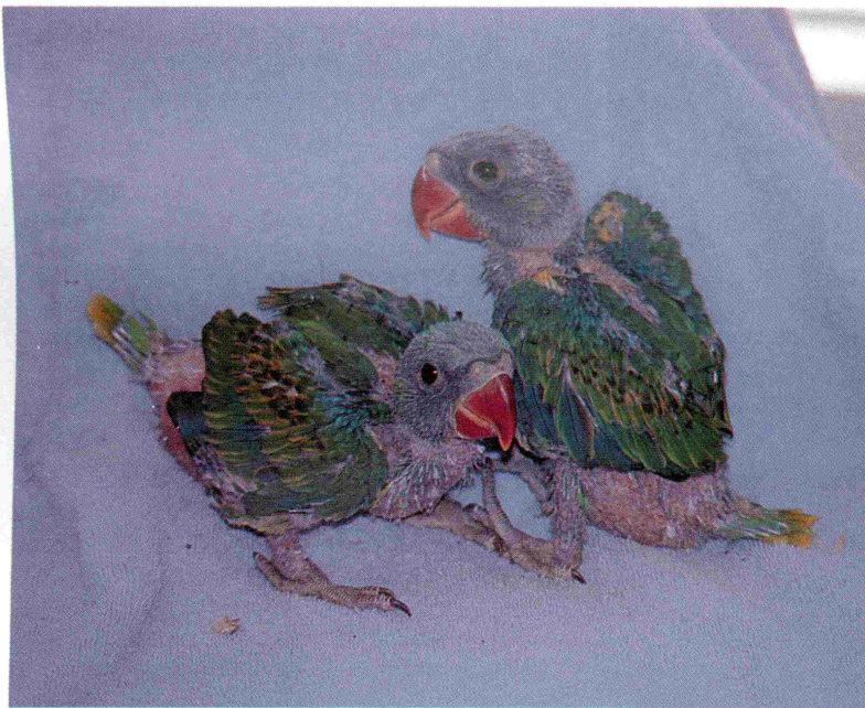
Female Great-billed Parrots that were removed from the nest (at seven weeks) for photographs. These youngsters were completely parent-reared.

T he Tanygnathus group of parrots originate from the Philippines, Sulawesi (Celebes), Borneo and other smaller islands of Indonesia. All are known for their large, heavy bills and relatively short, rounded tails. This gives them a top-heavy look. They are very beautiful with their shades of brilliant blues and greens contrasted by a large reddish-orange bill. Some have greenish-yellow scalloping on the primary and median wing coverts. The feathers on the chest region are often hair-like in appearance. This feature is well known in the Eclectus Parrots. In earli-