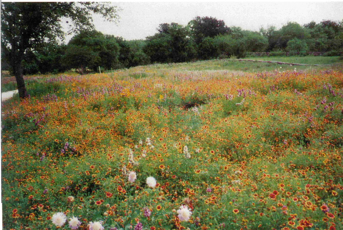
A delightful wildflower meadow at the San Antonio Botanical Gardens.