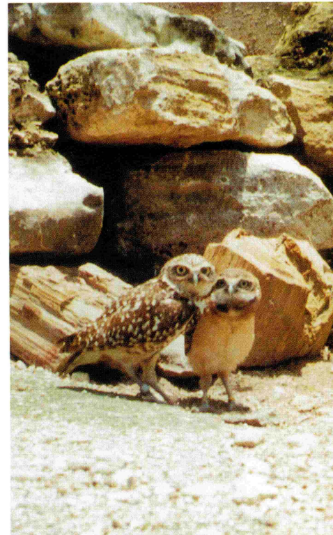
The San Antonio Zoo has a very impressive collection of birds. Two Burrowing Owls pose—an adult and a juvenile.