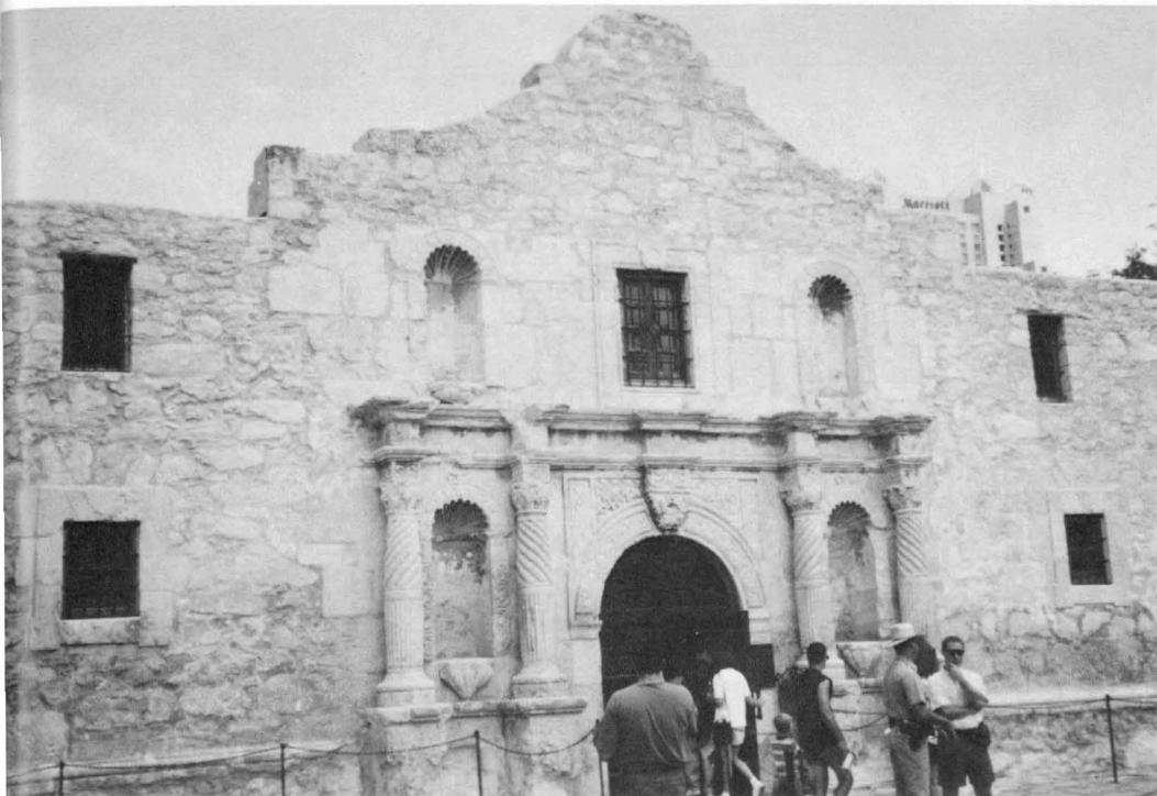
During the famous 1836 battle of the Alamo, 187 Americans fought 5000 Mexicans in a battle for Texas independence. All the garrison was wiped out including Jim Bowie and Davy Crockett.