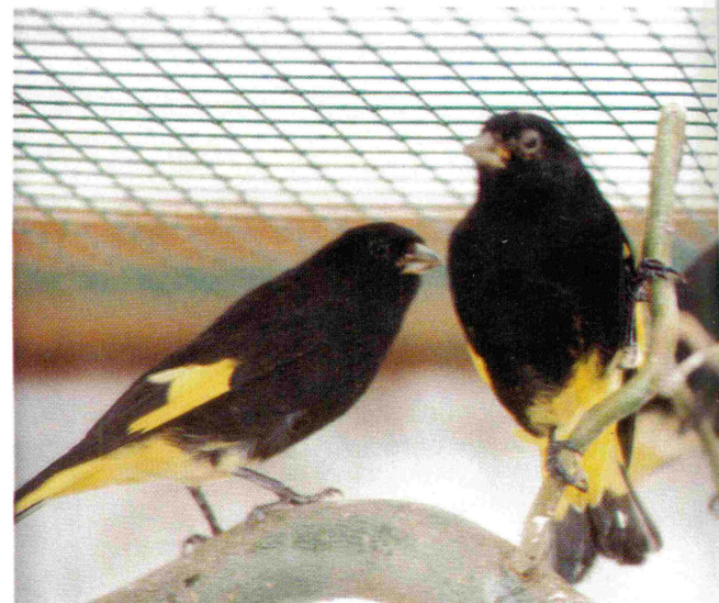
Black Siskins ( Spinus atratus )