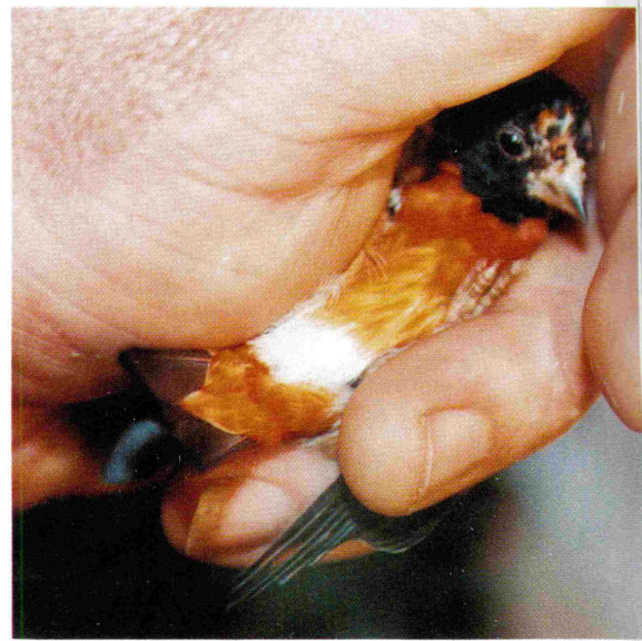
Red Siskin ( Carduelis cucullatus )