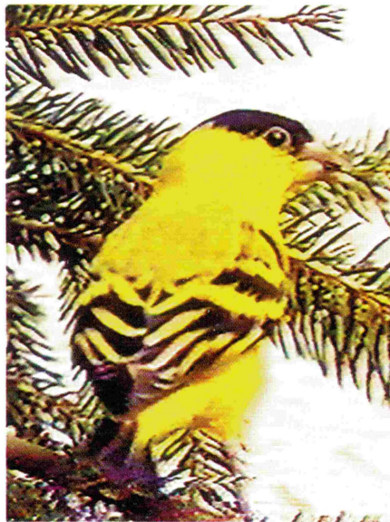
Yarrel Siskin ( Carduelis yarrellii ) from Brazil.

Some siskin species, such as the Red Siskin ( Carduelis cucullatus ) and the Saffron Siskin ( Carduelis siemerdzki ), are becoming rare or almost extinct in their native habitats. Others, the Yarrel Siskin ( Carduelis yarrellii ), for example, are known to be poor breeders in captivity—thus extremely