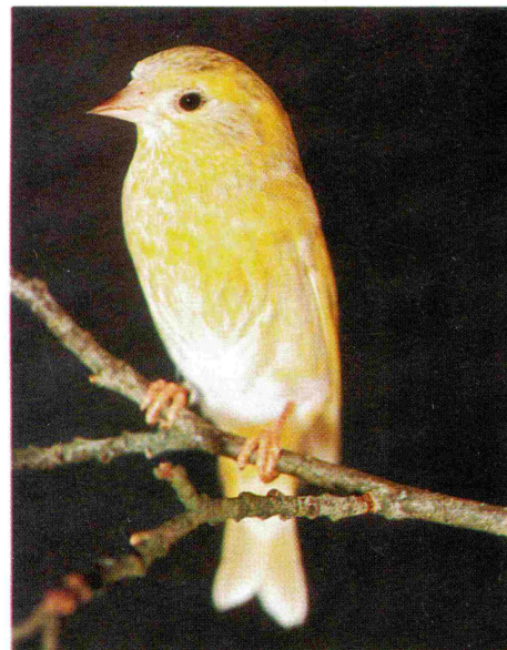
Eurasian Siskin female in double dilute mutation.