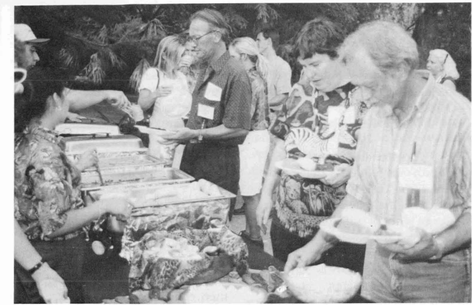
Feeding time at the San Antonio Zoo. The zoo staff treated the AFA folks like royalty.