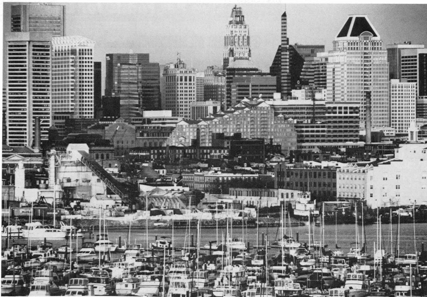
View of the busy scenic Inner Harbor, Baltimore, Maryland