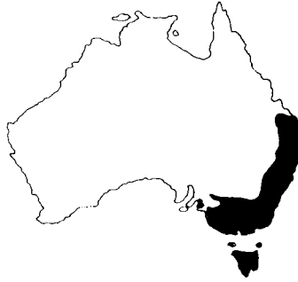
Distribution of the Eastern Rosella

The Eastern Rosella inhabits open forest and grassy woodlands near