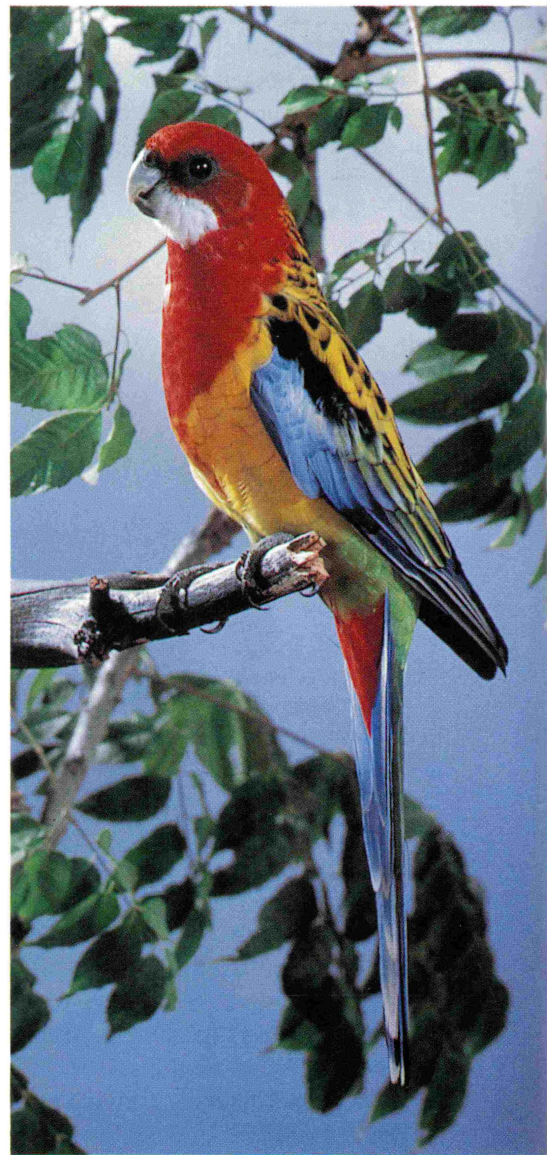
The true Golden-mantled subspecies has a rich yellow scalloped mantle instead of the green scallops of the Eastern Rosella.