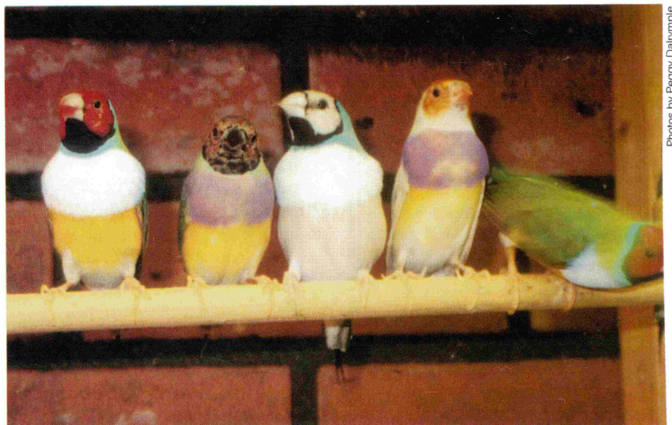
Well fed and cared for, Gouldian Finches can add interest and fantastic color to any aviary.

when coupled with stress in the birds' environment, may lead to under eating with the eventual result of illness or even death.