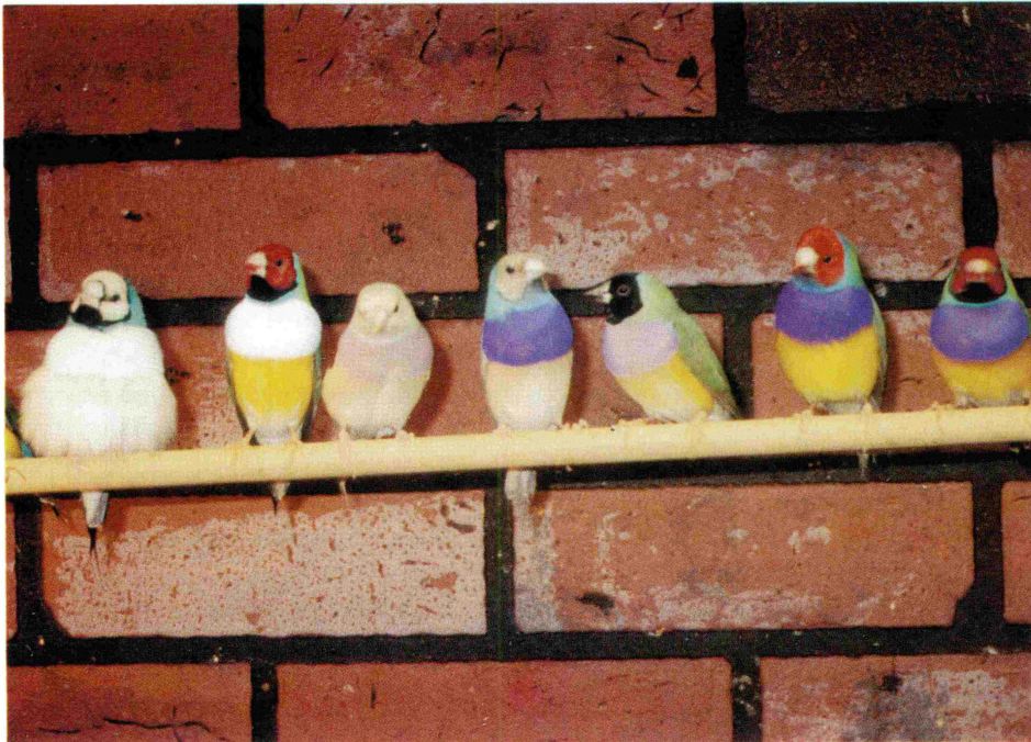
Gouldian Finches in their myriad colors are a wonder of the avian world.

T he gourmet meal I just spent 30 minutes preparing isn't for any of the people in my life, it's for the 200 Gouldian Finches that live and breed in my basement aviaries.