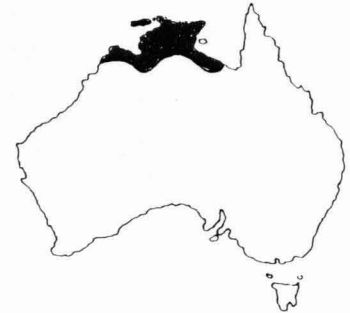
Distribution of the Northern Rosella on the Australian mainland.

Their habitat varies from coastal mangrove and pandanus thickets to