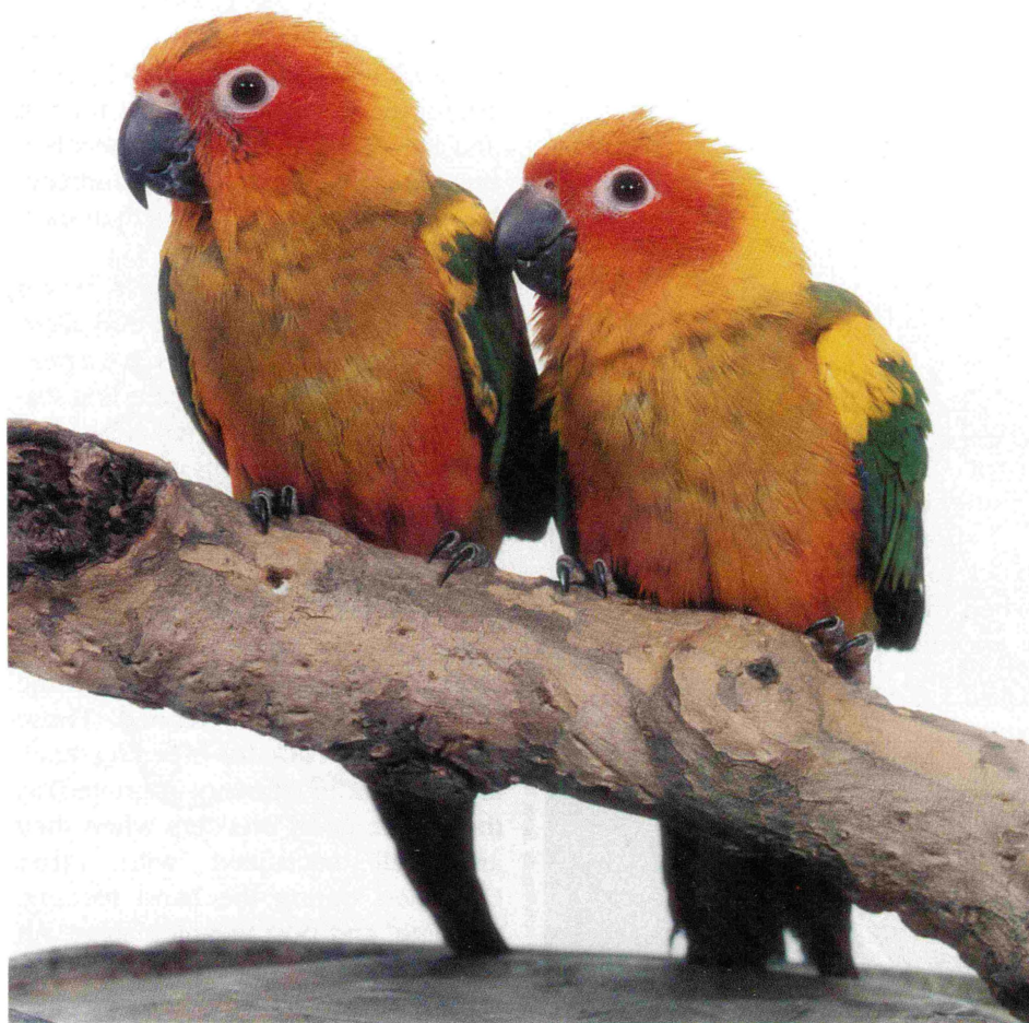
Brother and sister – twins from the same egg.

Any breeder can follow their dreams with Cockatiels, as there are so many color combinations to choose from. Work to reproduce your favorite color and it will give you great enjoyment. 🐦