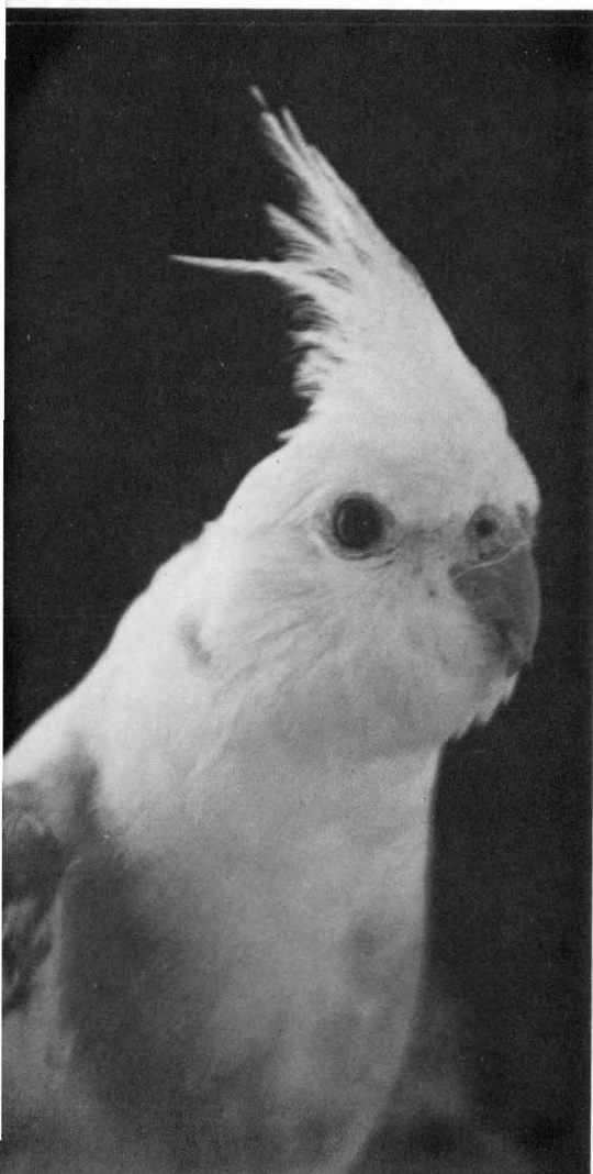
Whitefaced Cinnamon Pied male.

The feeding station, comprised of a zerk feeder for grains and one combination sprout/veggie dish, is situated in front of the cage for easy access. The food station is built out (boot style) and under the nest box so no fecal matter can drop into the food. There is a pull-out feature for ease of serving. No perch is placed directly over these dishes. Either the front perch is hung just back of the food and water dishes or I place a natural perch at an angle where one end is fastened into the corner of the cage where the nest box is hung. The feed and water dishes are placed away from this corner. The parent bird can easily enter the nest box by walking along the perch to the corner, which is very close to the opening of the nest box. The automatic watering system and misters are located at the opposite ends of each cage.