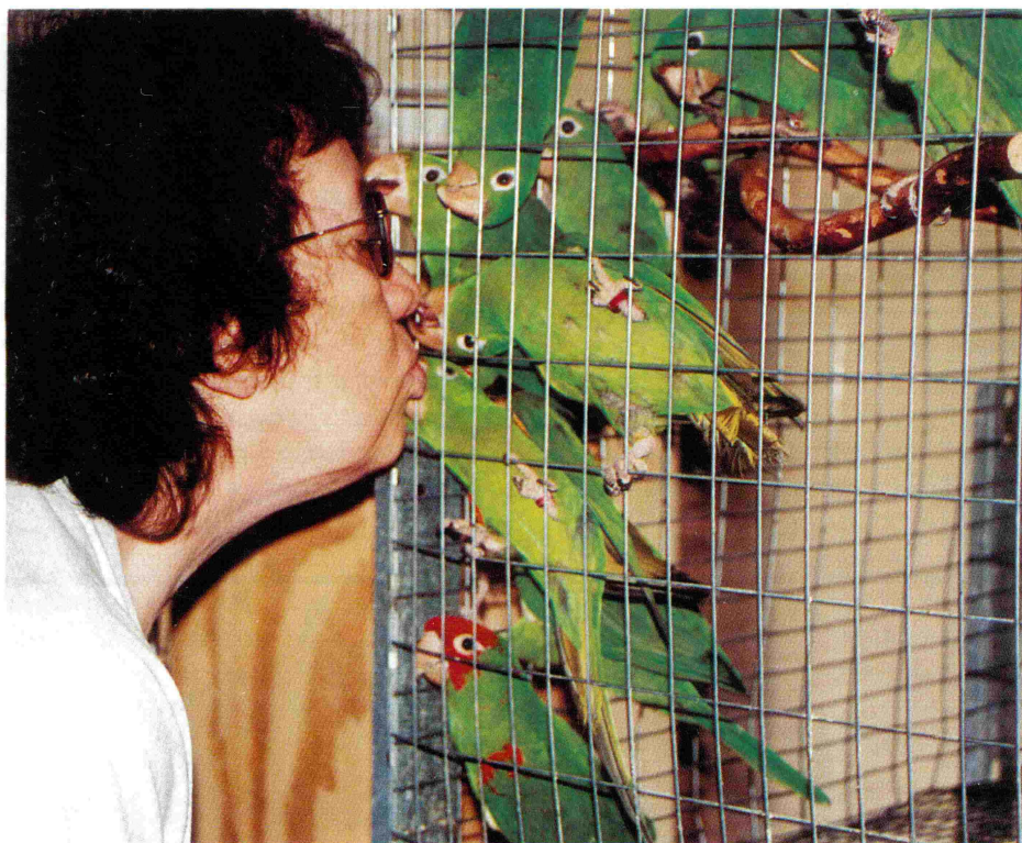
A cage full of juvenile Finsch's Conures coming to the wire to give the author a kiss. Note the Red-masked Conure at the bottom. She is the same age as the Finsch's Conures but at the young age of just 8 months displays lots of color.