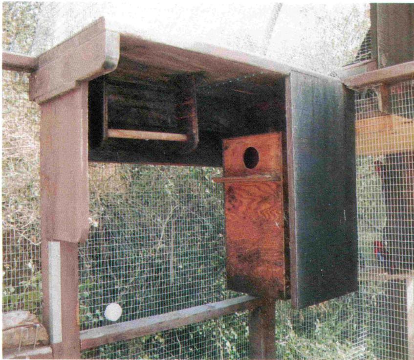
This nest box setup works well for rosellas