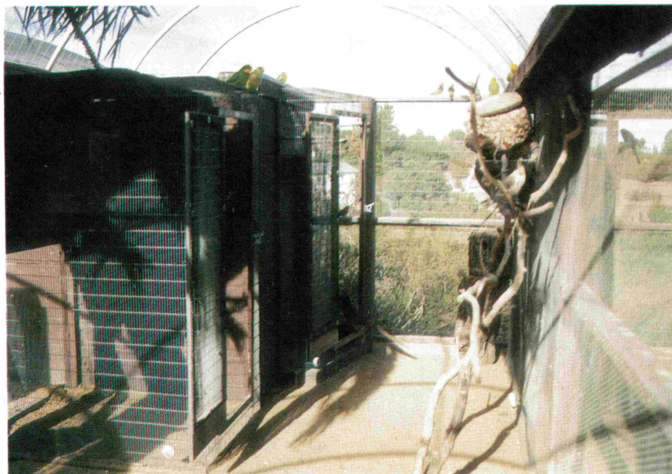
Part of the interior of one of Johnson's aviaries.

All of the cages are dome shaped. The rosella cages are 5 feet wide by 15