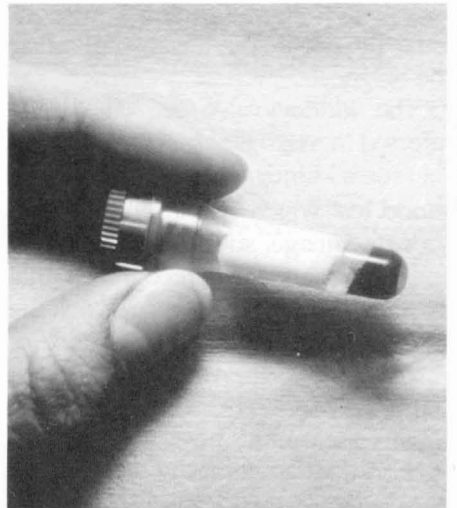
This blood sample contains about 40% fat, a serious problem.

A test which evaluates another part of the immune system is the Electrophoresis (EPH, SPE). Immune responses are characterized by changes in levels of certain blood proteins, and this test measures those proteins. Changes in specific proteins suggest the presence of certain physiologic or pathologic processes. Many conditions which would otherwise go undetected may be demonstrated with this test. This test also serves to strongly support or contradict diagnoses revealed by other tests.