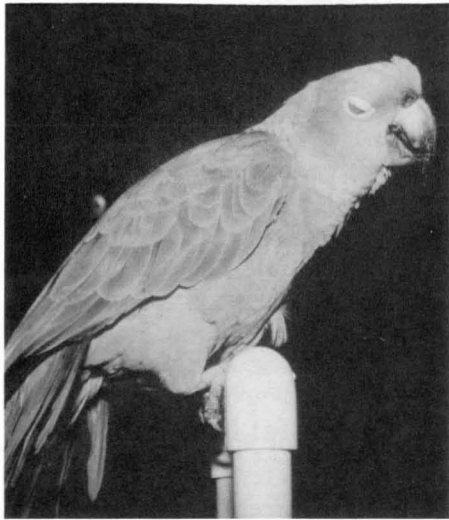
The unmistakable look of a sick bird.

Veterinarians have a tremendous responsibility when asked to qualify the health of an avian patient. The first and absolutely the most important principle to be understood is that no one, not even the most skilled of practitioners, can assure the good health of an avian patient through visual means alone. In other words, even the most healthy looking of birds can be harboring hidden disease for which there are no external signs.