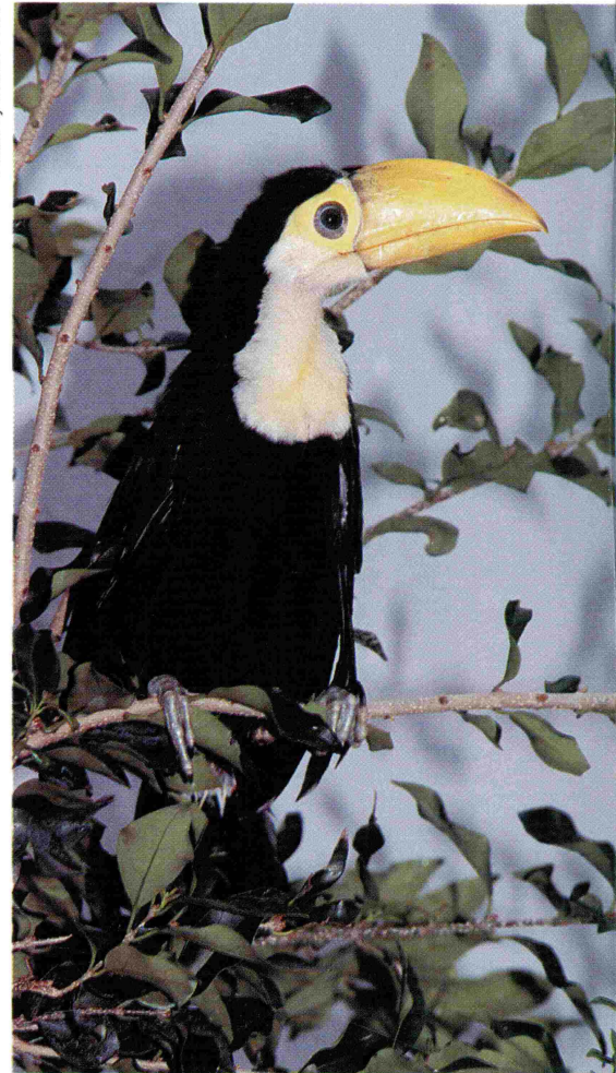
A six-week-old Toco Toucan on the day of fledging.