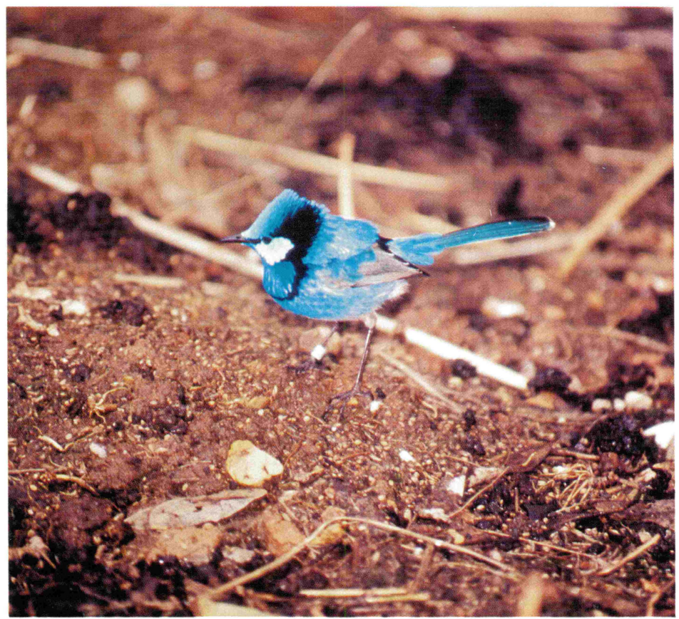
The splendid Fairywren Malurus splendens.

evolutionary advantage because the energy used to produce complex vocalizations to partition, hold, and defend living space, is less than the energy used in physical exertion to perform confrontational behaviors (which run the risk of injury) employed by other groups of birds. The Maluridae is made up of five genera. Two of these are endemic to New Guinea (Sipodotus and Clytomyias),