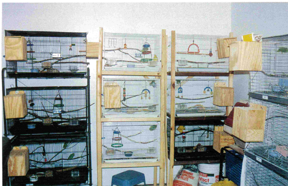
A view of Clay's bird room set up for parrotlets.

in a bird magazine a few years back and upon investigation he found the species to be small birds with great big personalities. In typical fashion, he found he couldn't have just one.