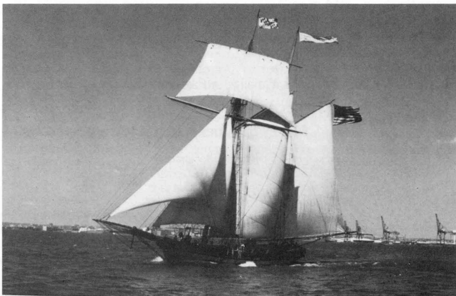
"Pride of Baltimore II" under full sail. This historical vessel is a topsail schooner, one of many well maintained sailing boats around the harbor area.