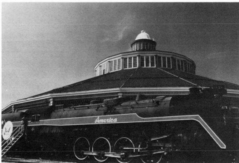
While in Baltimore, visit the famous B & O Railroad Museum.