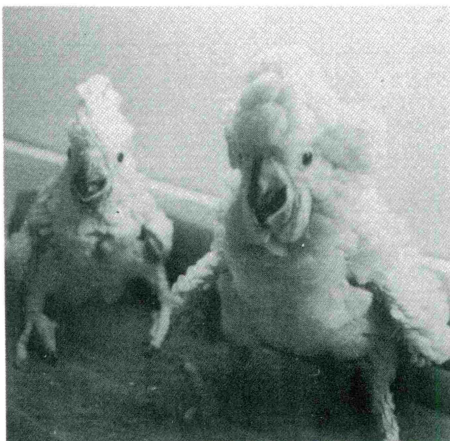
Two basement beauties.