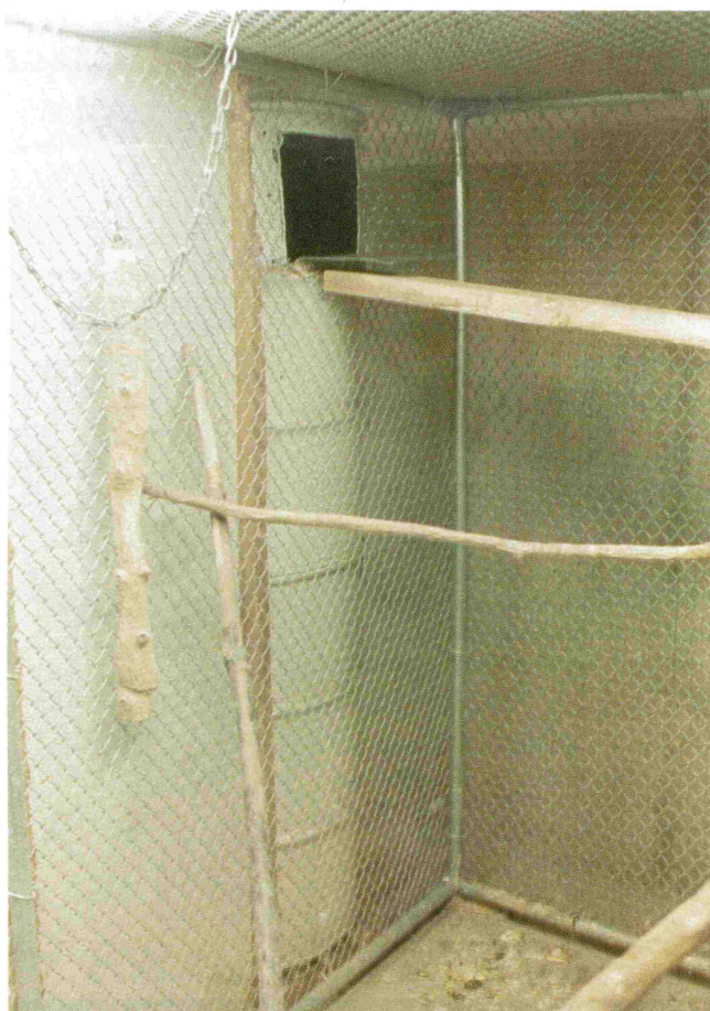
The second story apartment.