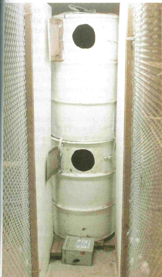
Condo style nest drums with inspection doors open.

dive into their nest boxes. Due to the commotion upon entering the basement, we made only one trip there daily. During that time all feeding, watering, and maintenance was completed. A rare undetected observation revealed what appeared to be a territorial display between males protecting their feed bins.