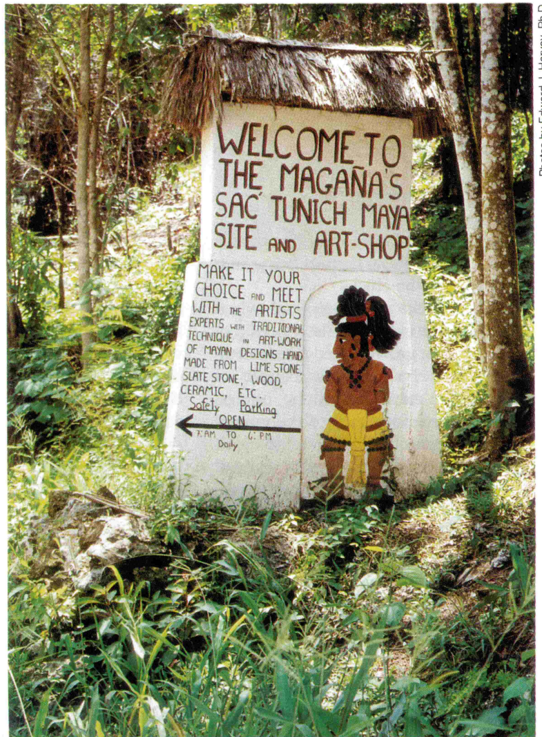
A Modern Stela — a jungle billboard.