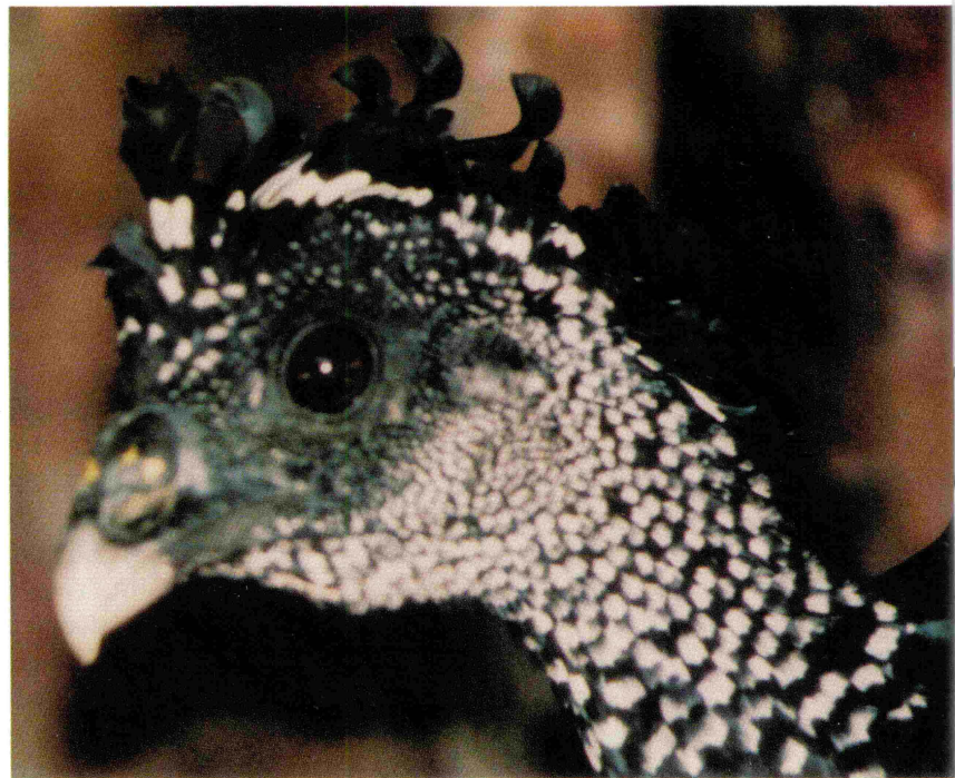
Female Crax rubra — The Great Curassow.