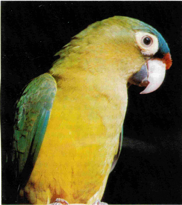
Adult Petz's Conure, A. canicularis , from Quimixto, Mexico.

The keeping of birds and other animals for pets extends far back into the ancient past. Both art and archeology have shown that man has long been fascinated with his fellow creatures. He has kept as pets: fish in tiny bowls, glass fronted ant farms, string-tied June bugs, painted turtles, horned lizards, cats, dogs and even elephants.