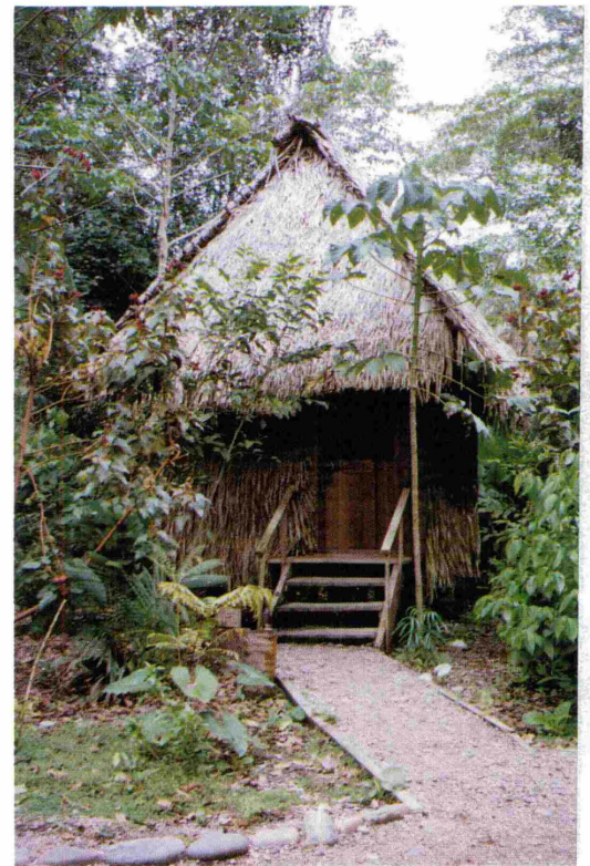
Jaguar bungalow at Manu Wildlife Center

Some of you parrot fanatics thought I would never get to this part! Well, there is some good news and some bad news. The good news is that the