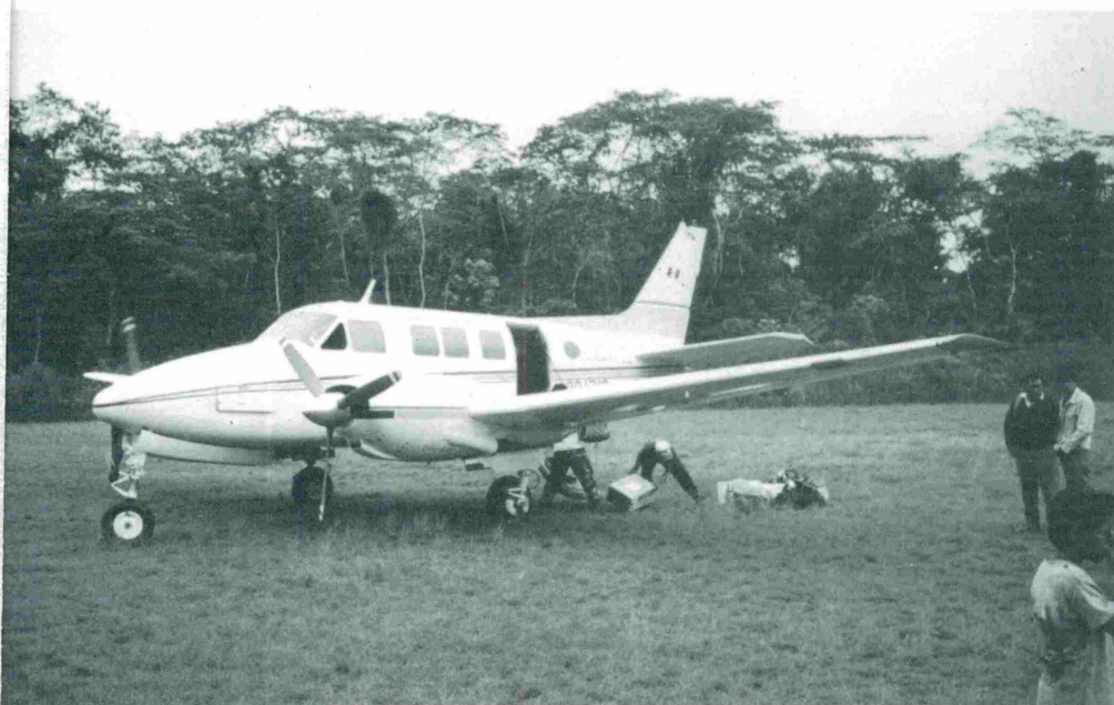
Charter plane at Boca Manu airstrip.