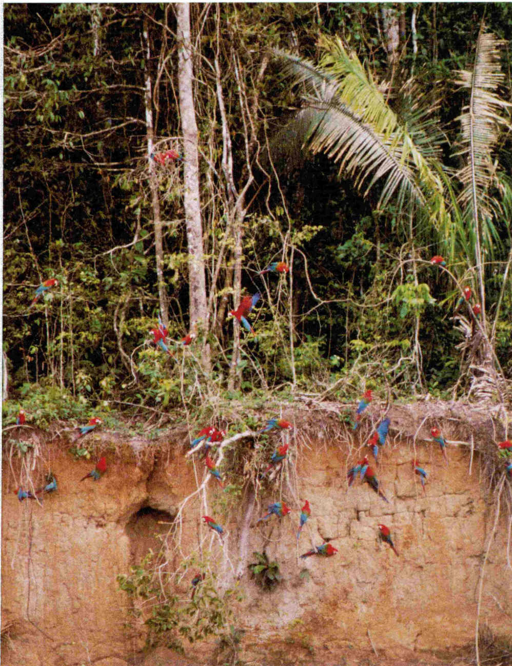
Macaws on and above the clay lick.

But the list of sightings goes on! In various places we saw the Cuvier's Toucan, Wattled Jacana, Paradise Jacamar, Spix's and Piping Guans, Olive and Crested Oropendula, Tricolored Trogon, White-lored Euphonia, Yellow-rumped Cacique, and more. Get the