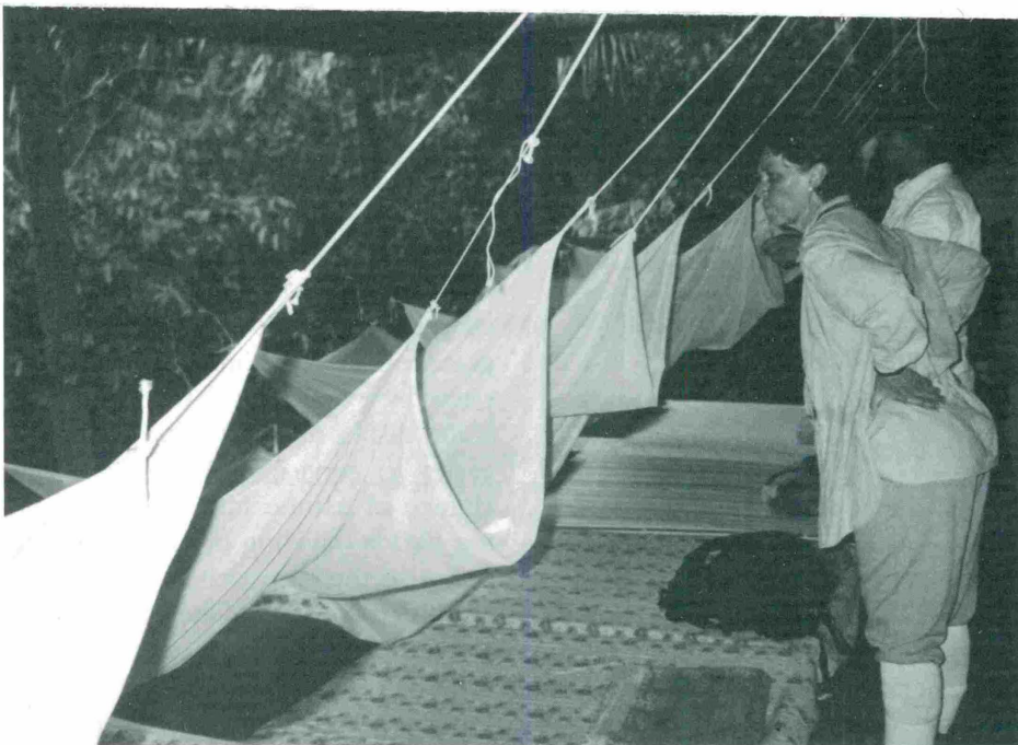
Observation platform at the center's mammal clay lick “You expect me to sleep where?”

During our visit at the Manu Wildlife Center we were blessed with really good weather. The morning of our departure to meet our charter plane at Boca Manu, however, it was raining as only it can in the rainforest. Hard! When we arrived at the airstrip we found that our plane wouldn't be coming to pick us up until the strip and turnaround area was less wet. I understood the full implication of this when I noted that some bored traveler had carved this message on a bench: “RHL, waited for plane IIII II days, Sep 97” That got my attention!