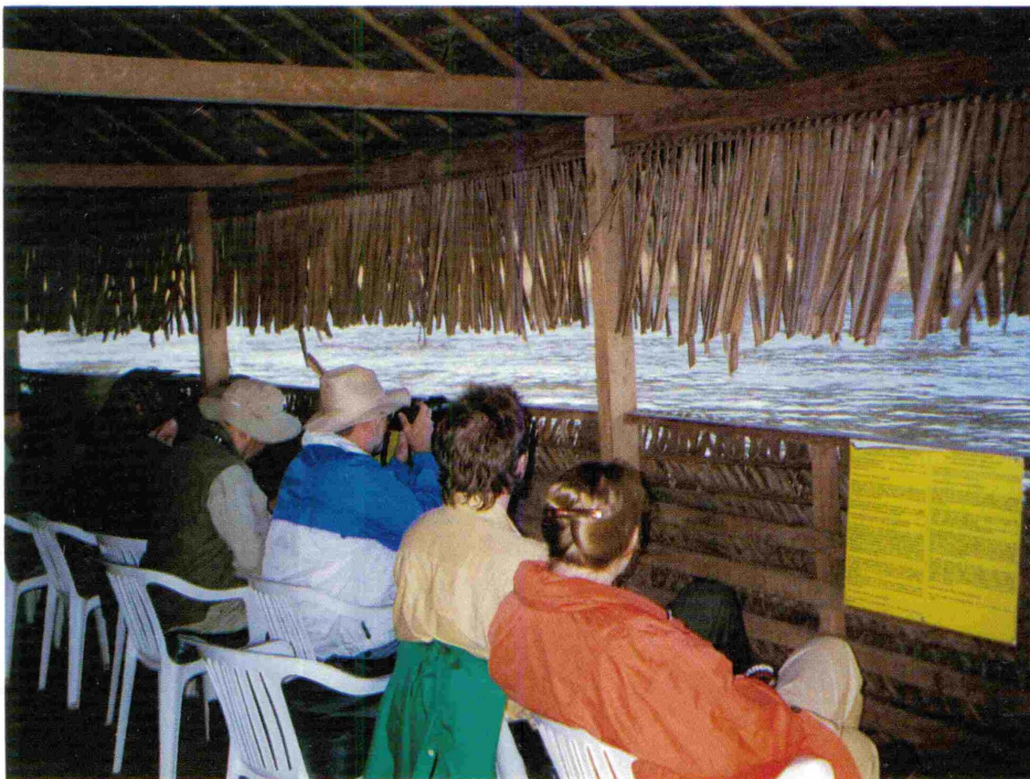
On floating blind at the Blanquillo Manu macaw clay lick.