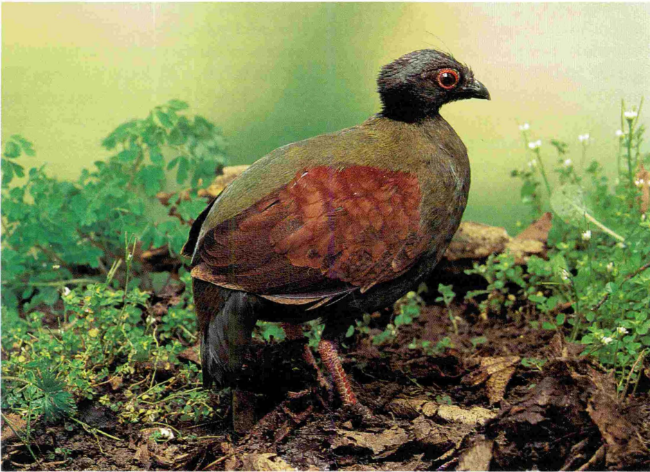
The female Roulroul Partridge has her own subtle beauty. Compare with the male on the front cover.

The Roulroul Partridge Rollulus roulroul as it is known in aviculture, is more often referred to in ornithological literature as the Crested Wood Partridge – a more apt name because the male has a very attractive maroon crest, offset by the white crown patch. However, neither of the names fully describes the beauty of this species.