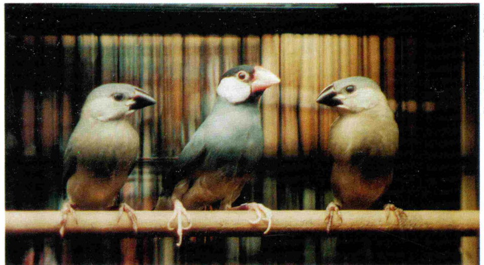
A Java Sparrow surrounded by two juveniles. Note the difference in beak and plumage colors. Some states prohibit the keeping of this species.