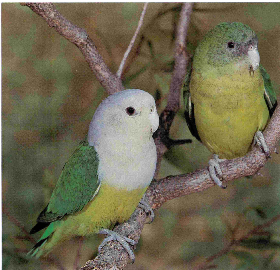
The Madagascar Lovebird is another small (5 in) species that originates from the island of Madagascar in the Indian Ocean. This sexually dimorphic species - only the adult male has a gray head - has proved quite difficult to breed and needs establishing in aviculture worldwide.