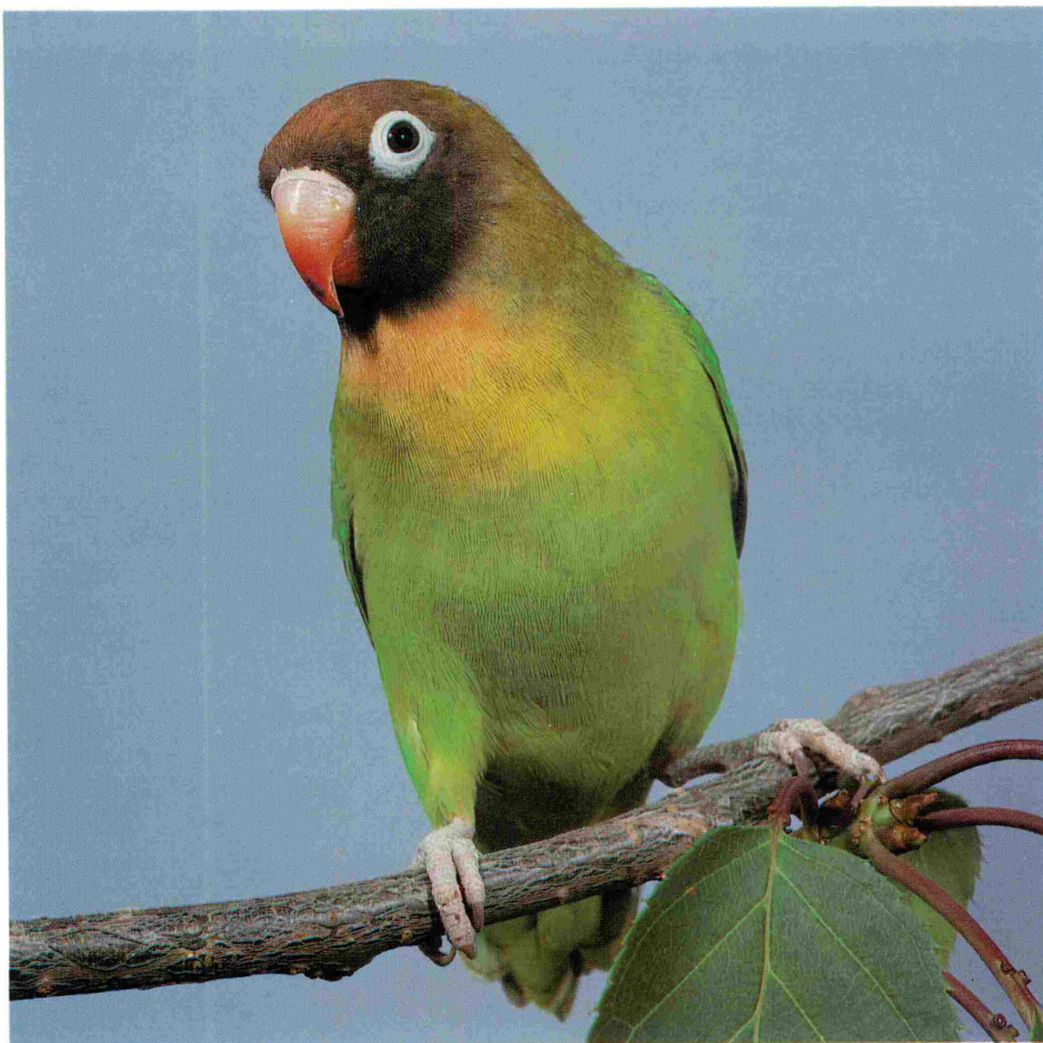
An endangered species in the wild, the Black-cheeked Lovebird is reasonably well established in European collections, with many mutations recorded - a number of which are transmutations within the "eye-ring" group. It is rare in USA collections.

Most of the lovebirds have fairly wide and large beaks, which vary in color depending on the species. The Peach-faced Lovebird has a horn-colored beak with a green tinge on the