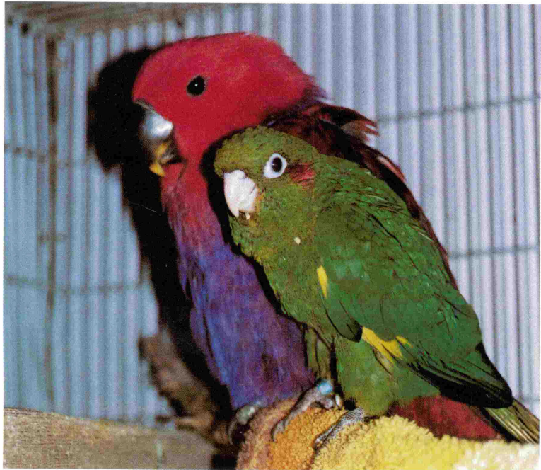
The Odd Couple. These youngsters – a vosmaeri Eclectus and a Hoffmann's Conure – were handfed together and became buddies.

produced offspring. The first two years produced 14 males and three females. This was a very lop-sided ratio. We had to set aside so many of the early males as mating them would have caused inbreeding problems we were trying to stay away from.