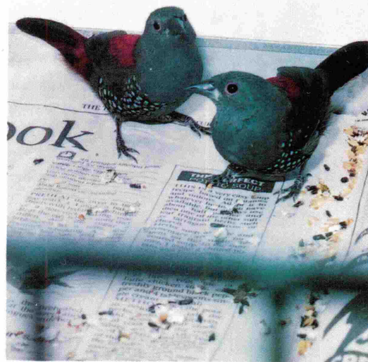
Two juvenile Dybowski's Twinspots. Note the whitish cape remnant which is absent in the mature bird.

Besides the above, I also offer British Finch mixture. This has come about because, a few years ago, I kept a mixed collection of waxbills and some goldfinches together in a free-flying birdroom and put separate dishes down containing seeds for both types of birds. Within a short time I noticed the waxbills taking seeds from the goldfinches' dishes – basically canary seed, rape, niger, linseed, gold of pleasure, and small amounts of hemp and teazle – and vice-versa. Ever since, I have provided the British Finch mixture as a daily accompaniment to the