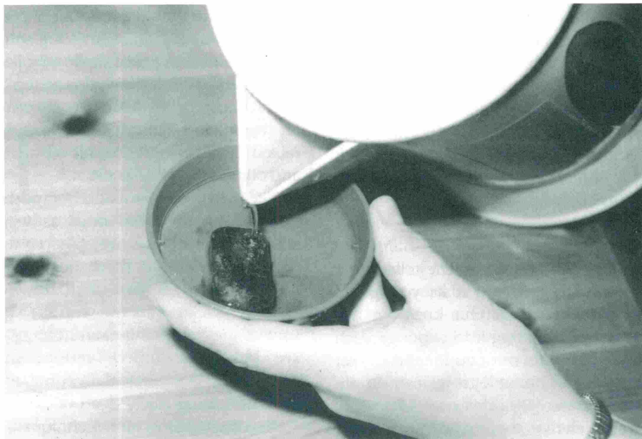
Pouring tepid water onto a frozen cube of Bloodworms.