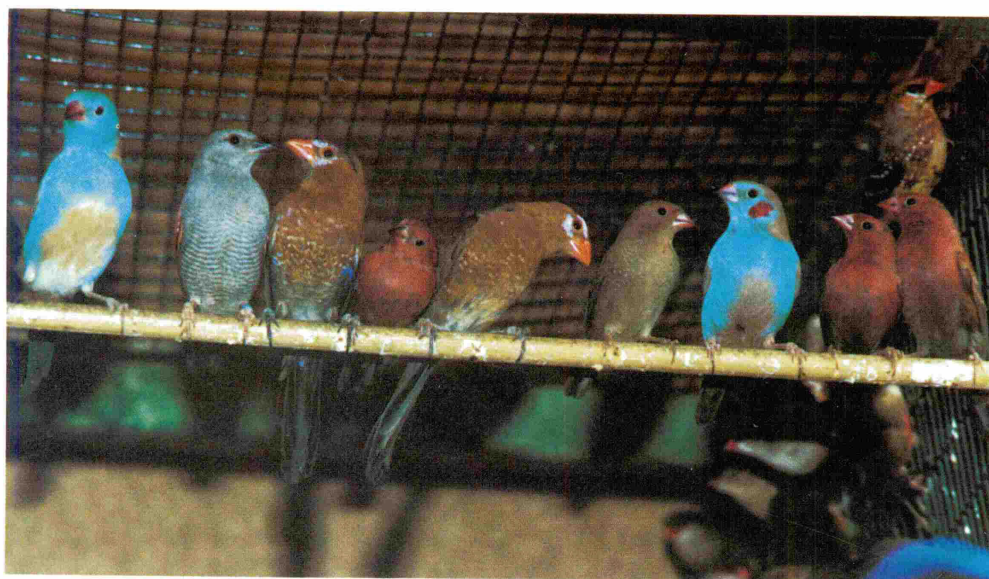
A mixed collection of waxbills from the collection of Ian Hinze.