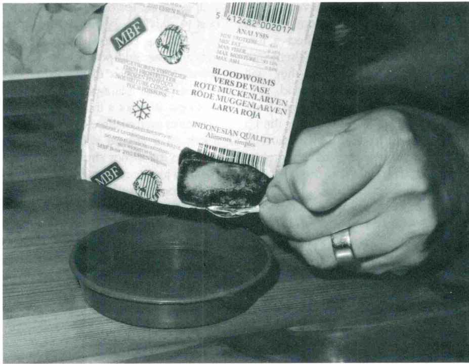
Pressing frozen Bloodworms out of foil wrap.