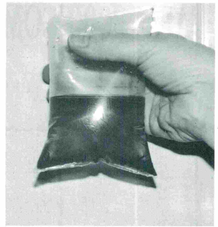
Live bloodworms purchased in a sealed bag.

The aviculturist's great favorite, the mealworm, Tenebrio molitor , (its larvae, actually) can often play a most valuable part in waxbill breeding. To breed this insect, get some plastic trays, about 3-4 inches in depth, and place equal amounts of larvae into each tray and cover with an inch of chicken meal - not bran! Mealworms