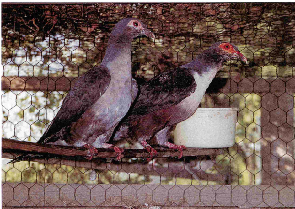
A pair of the Papuan Mountain Pigeons. The more colorful male is on the right.

In addition to the Papuan Mountain Pigeon, the aviary contains Green-