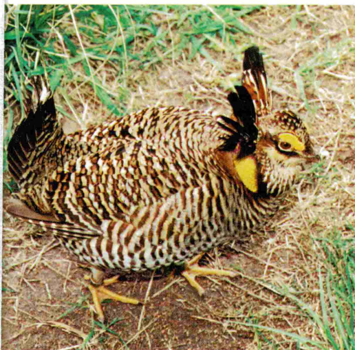
Male Attwater's Prairie Chicken.