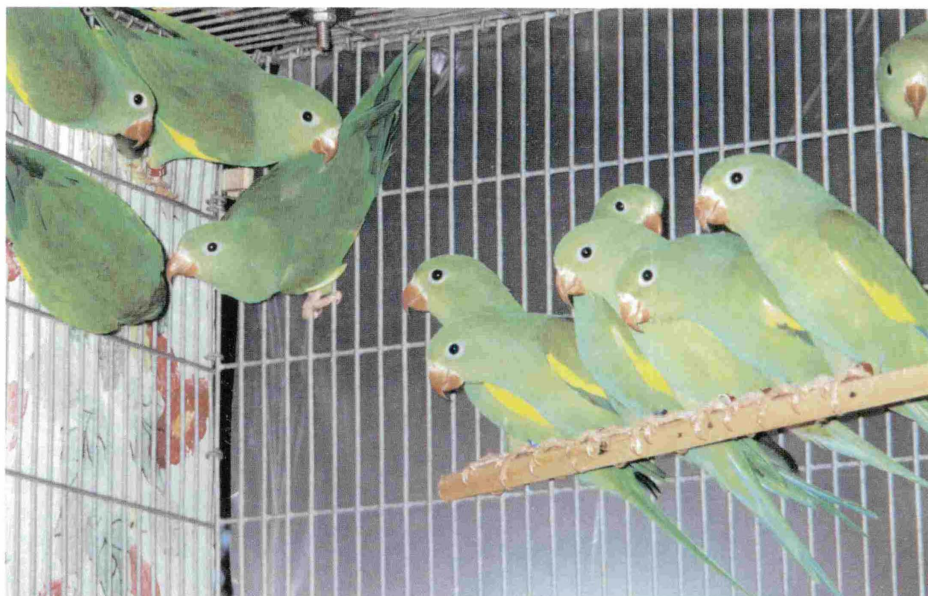
A small flock of Canary-winged Parakeets were pulled together from sundry sources across the United States and established in two colonies at Secret Garden Aviaries. The birds all got along well and there was no hostility or aggression. Gradually pairs formed up within the flock. One key to the successful breeding here may have been that the birds were free to choose their own mates.

It wasn't until I heard an unusual sound during the 1st of July in 2001 coming from the Canary-winged flight did I realize my setup and diet was to their satisfaction and I was successful at