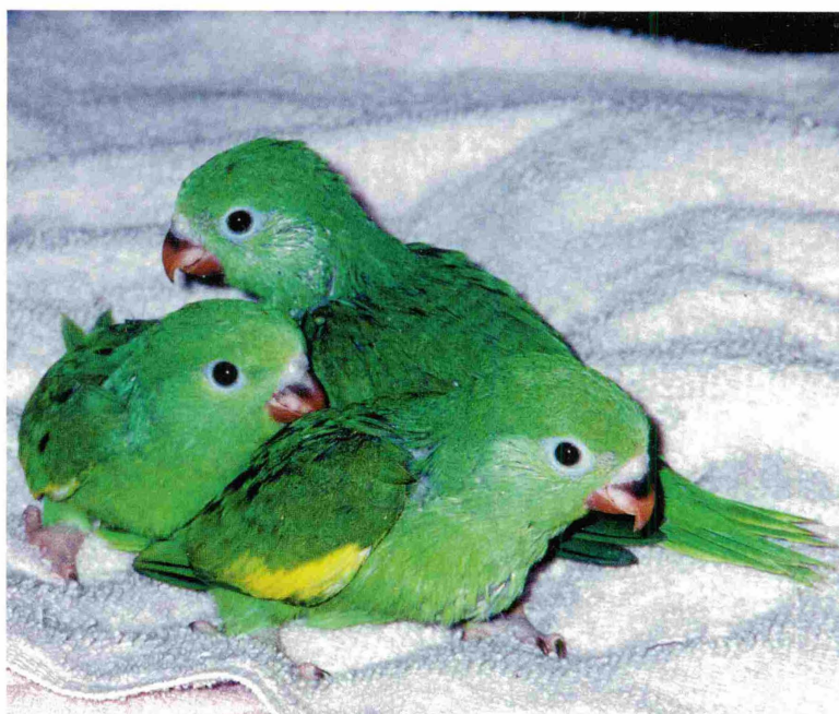
The first clutch of baby Canary-winged Parakeets are about to fledge. They were hatched in July 2001 and are well and thriving now in 2003. With a little luck, these parent-reared birds will go on to become good breeders.

The Canary-winged Parakeets were great parents and tolerant of my daily nest inspections. I was warned that Brotogeris were not good parents,