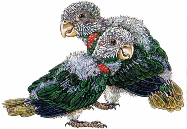
Baby Blue-throated Conures AFA 30 Evolution of Aviculture