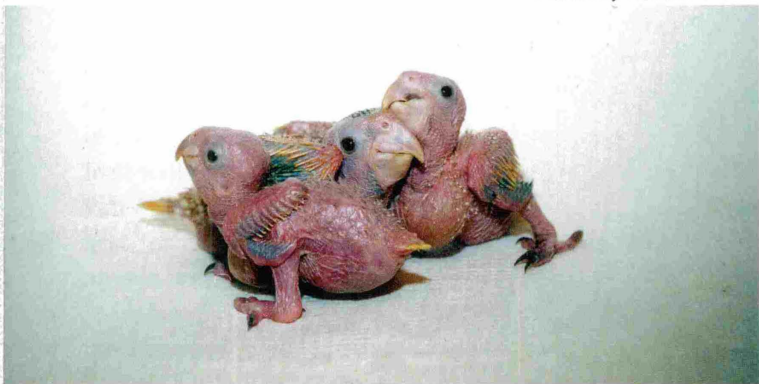
Of course, one begins with babies like this in the nest. There are several ways one can carry on from this point in the effort to bring the babies to fledging.

trees. Deforestation of this parrot's habitat is taking place at an alarming rate.