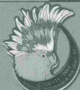
CITES Pin #11 Major Mitchell's Cockatoo