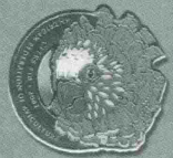
CITES Pin #10 Hawkhead Parrot