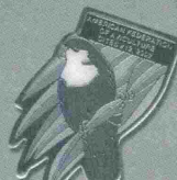
CITES Pin #12 Tahitian Lory