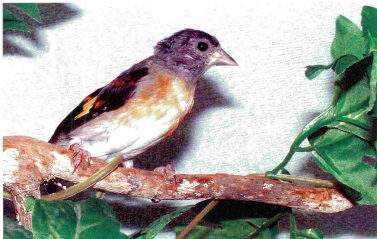
Female Black-headed Red Siskin

Male 94 band - T833 & Female 1220 band - T1156 Hatched 2/03 Closed Banded = 904 03 C NFS, 905 03 C NFS Other markings on band purple color Total hatch 2