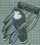
CITES Pin #12 Tahitian Lory