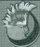
CITES Pin #11 Major Mitchell's Cockatoo