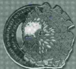
CITES Pin #10 Hawkhead Parrot