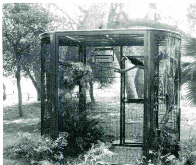
#7 - Innovative Inclosures